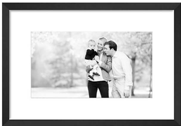
LARGE 30" x 20" £650