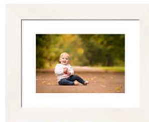
SMALL 16" x 12" £250