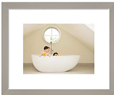
MEDIUM 20" x 16" £450