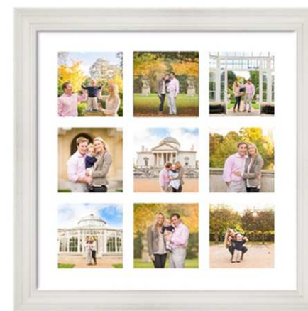
24" x 24" 9x 6" x 6" £750