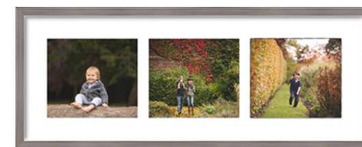
28" x 10" 2x 6" x 5" + 1x 12" x 6" £550